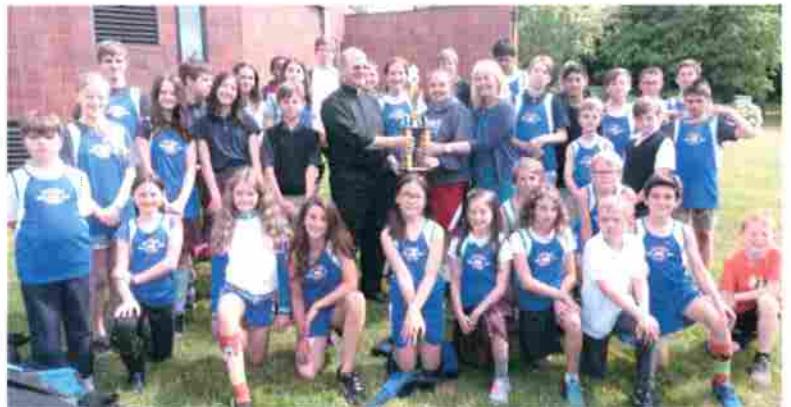
2017 Track 1 st Place Champions