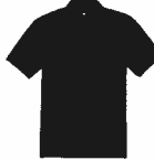
Men's Performance Polo Shirt