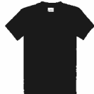
Short Sleeve T-Shirt