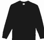
Long Sleeve T-Shirt