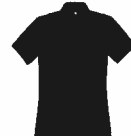
Ladies Performance Polo Shirt