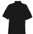
Men's 50/50 Polo Shirt