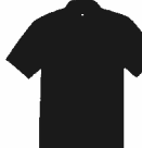
Men's Performance Polo Shirt