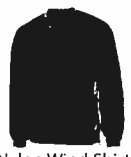
Nylon Wind Shirt