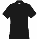
Ladies 50/50 Polo Shirt