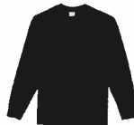
Long Sleeve T-Shirt