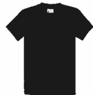
Short Sleeve T-Shirt